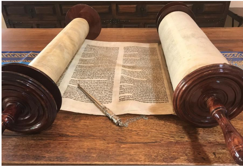
Congregation Faithful Stewardship Torah Scroll. (Written in Romania, circa 1936, during the rise of extreme anti-Semitism which led to WWII and the Holocaust.)