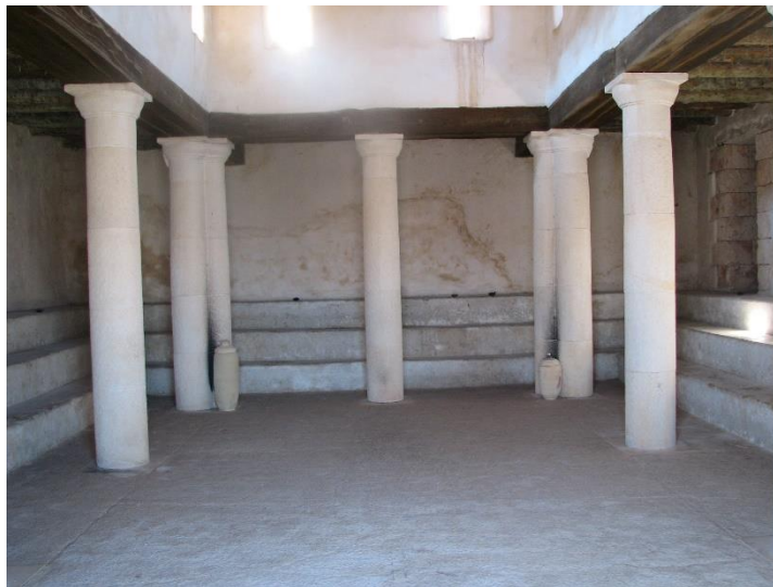
A small synagogue replica constructed in the much the same way the village synagogue was during the time of Yeshua. Nazareth Village, Israel.

“And he came to Nazareth, where he had been brought up. And as was his custom, he went to the synagogue on the Sabbath day, and he stood up to read.” Luke 4:16 ESV.